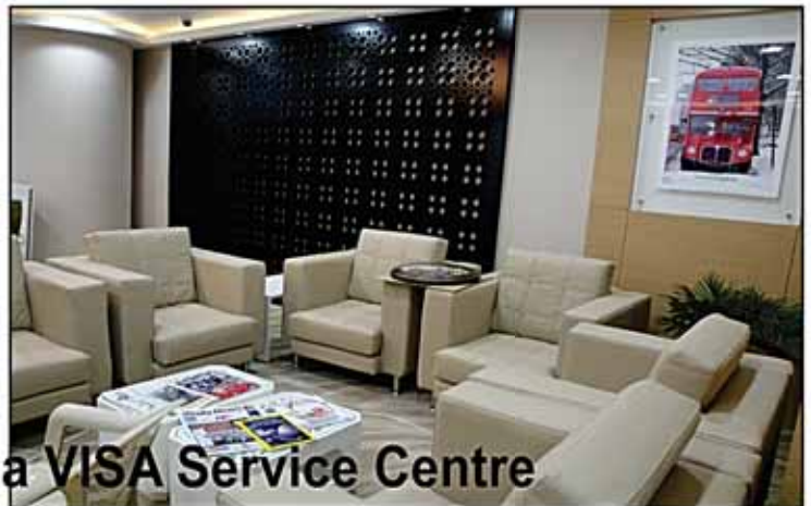
UK & Australia VISA Service Centre