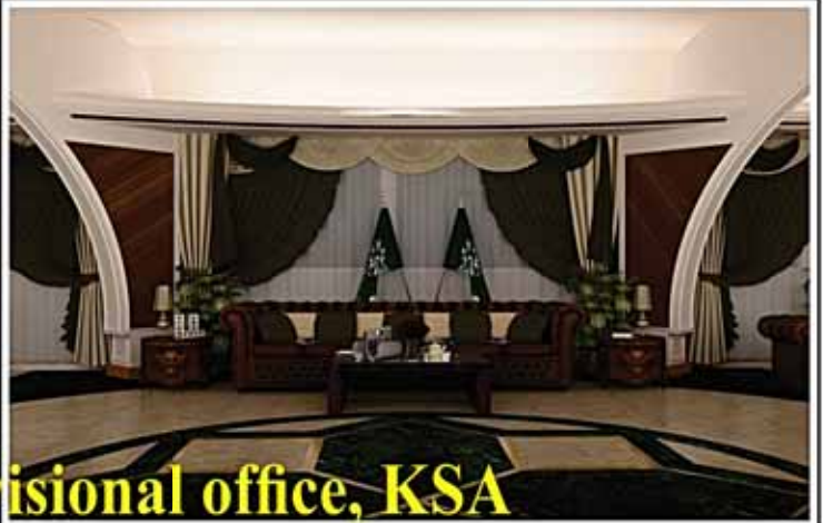
Prince provisional office, KSA